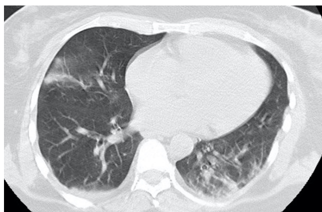
Figure 2: Non contrast chest CT showing subpleural – Multifocal bilateral ground-glass opacities and consolidation of the basal and posterior aspect of the left lung, suggestive of viral pneumonia.

language and mild strength recovery, 2 weeks later she was considered for discharge.